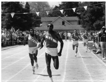
L2006-14-4. John Carlos and Tommie Smith, Speed City, 1968.