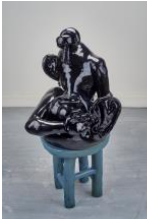
Woody De Othello, Defeated, depleted , 2018. Ceramic, underglaze, and glaze, 38 x 22 x 19 inches. San José Museum of Art. Gift of Tad Freese and the Lipman Family Foundation. 2018.13.