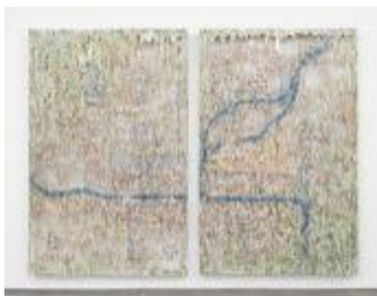
Diana Al-Hadid, South East North West , 2017. Polymer gypsum, fiberglass, steel, plaster, gold leaf, copper leaf, painter's tape, and pigment, 130 x 168 x 5 inches.

Opening alongside With Drawn Arms , SJMA will present the first solo museum presentation by Bay Area artist Woody De Othello. Woody De Othello debuts a new body of work based around SJMA's recently acquired sculpture by the artist, Defeated, depleted (2018)—a dark and richly glazed vessel atop a low stool.