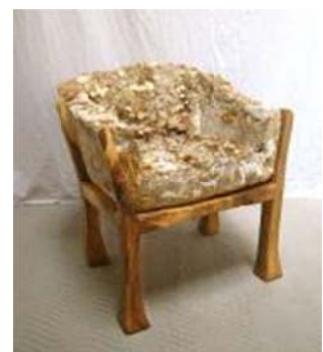
Phil Ross, Yamanaka Wisdom; Selection from The Workshop Residence in SF.